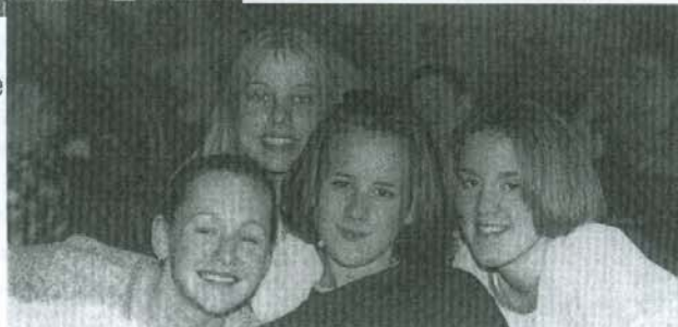
Who Do You Remember?