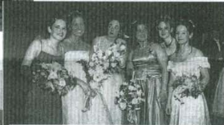
These senior girls are posin' pretty